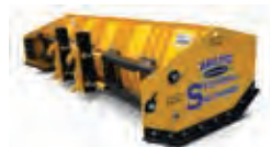
Arctic® Sectional Sno-Pusher™