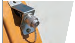
Front Electric/ Multi-Function