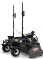
Laser Grading Box

All models come standard with a universal coupler that will work with numerous attachment manufacturers, meaning you can do more with a single machine to give your business even greater versatility. Consult your dealer for details.