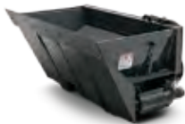
Side Discharge Bucket