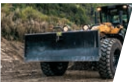
FRONT DOZER BLADE

CASE C Series graders are available with a wide variety of fittings making them suitable for a great number of applications: