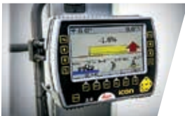
MACHINE CONTROL READY