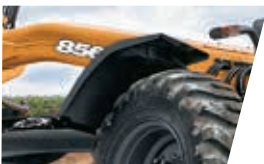
STANDARD FENDERS FRONT AND REAR