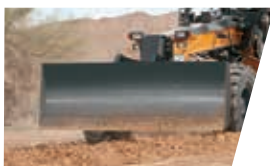
FRONT DOZER BLADE

CASE offers a variety of B Series grader attachments, including: