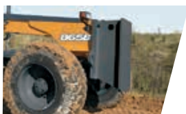
FRONT PUSH PLATE