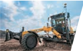
UNIVERSALLY COMPATIBLE WITH LEICA, TOPCON AND TRIMBLE