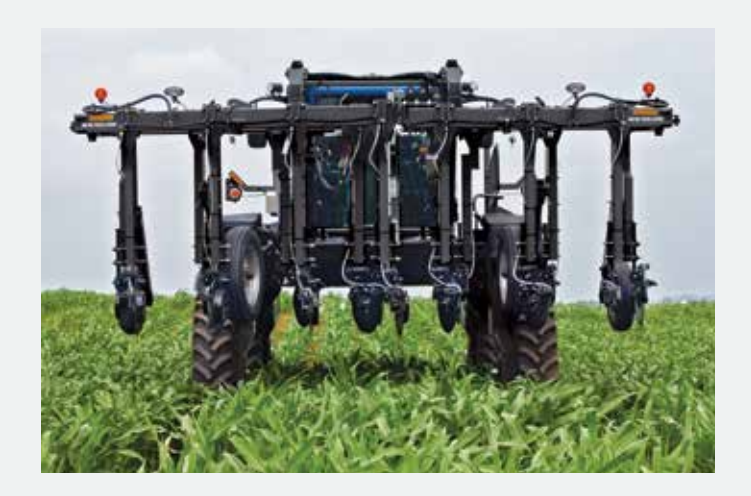
The Guardian \ensuremath{^{\text{TM}}} Injection Toolbar folds for convenient road or field transport.