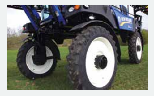
Planetary Drive - SP.300F/SP.345F/SP.400F