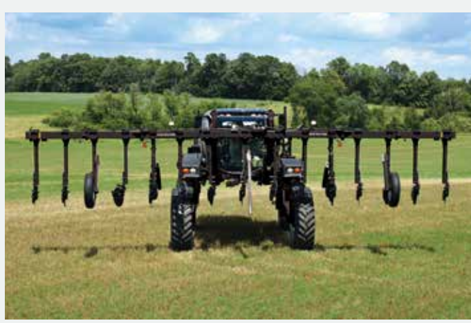
\label{thm:light} \mbox{High lift clearance helps the coulters clear crops and obstacles at the headlands, minimizing the potential for damaging corn stalks.}