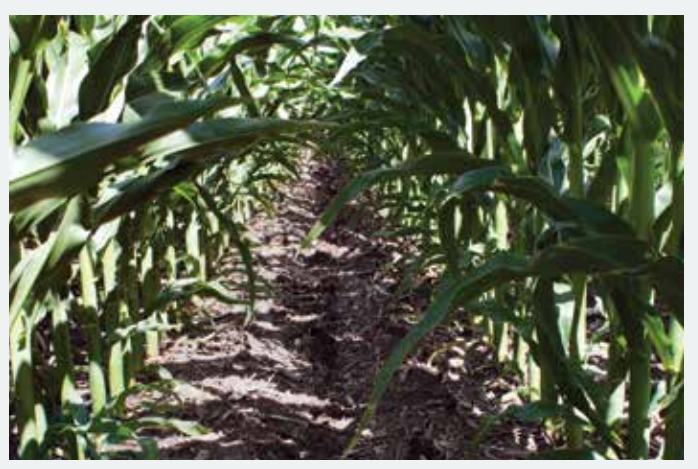
The Injection Toolbar delivers precise injection of fertilizer into the root zone, where your crop needs it most.